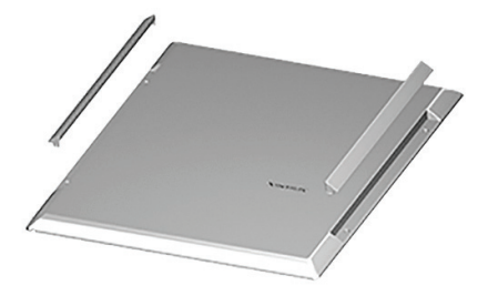
snap-on screw covers